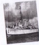
USS Enterprise (CV 6) was ordered stricken from the Navy list and sold for scrap Oct. 2, 1956. Enterprise was in more action in World War II than any other carrier. She had been decommissioned following the war and laid up at Bayonne, N.J. This image is from April 12, 1939. [80-G-463246]